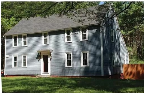
Deacon Samuel Hill House Circa 1725

Galehurst. Their ownership of the colonial house was not without some difficulties. In February of 1941, a fire of undetermined origin broke out in the dining room of the establishment. The blaze worked its