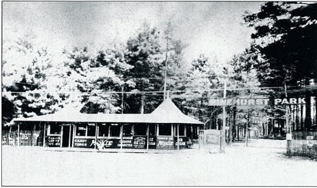
PINEHURST PARK 1918