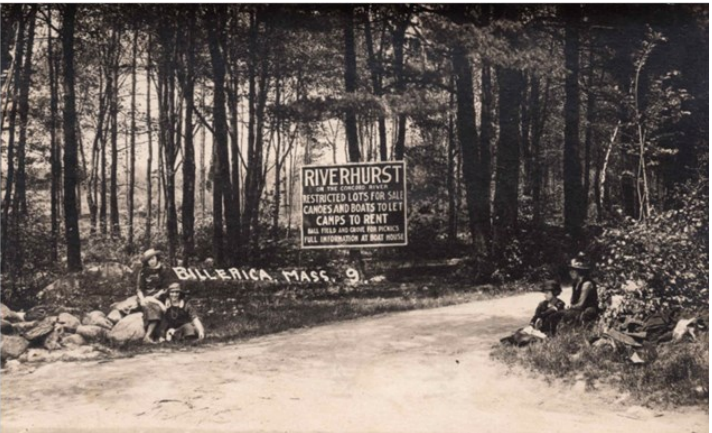
Sign at the entrance to Riverhurst Four girls in the foreground

The Riverhurst area is located on the Bedford side of Concord Road, immediately after route 3, and goes down to the Concord River where one can find Barrett's Landing. Today, you can still launch your kayak or canoe when you plan to enjoy the river.