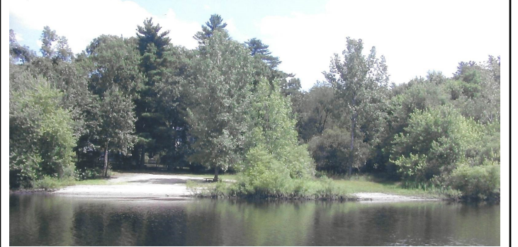
Bartlett's Landing as seen today.